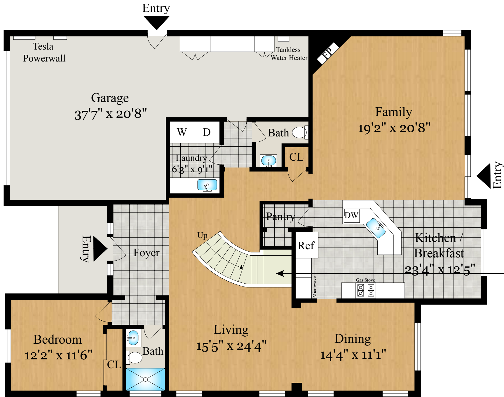
MAIN LEVEL 1,783 SQ FT